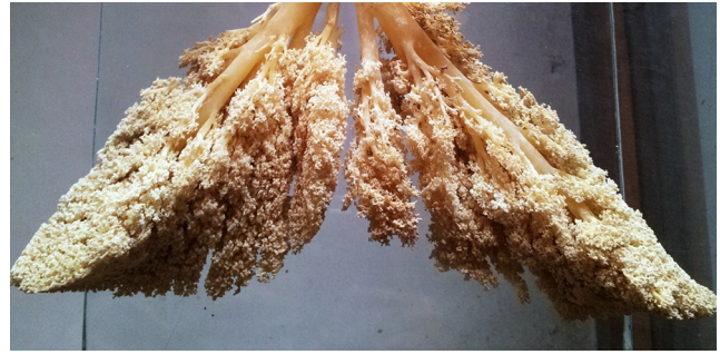
Bronchi, bronchioles and alveoli can be clearly visualized.